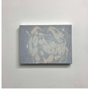
Beulah 1 Bleach on hand-dyed linen 2023