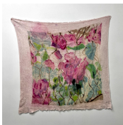
Black Rose Polychromatic screenprint on terrycloth 2023