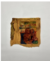
All In Me Dye on hand-dyed silk 2024