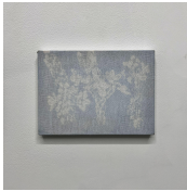
Aurora Vervain Bleach on hand-dyed linen 2023