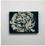
Beulah 2 Bleach on hand-dyed linen 2023