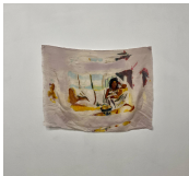
Ex-Factor Dye on hand-dyed silk 2024